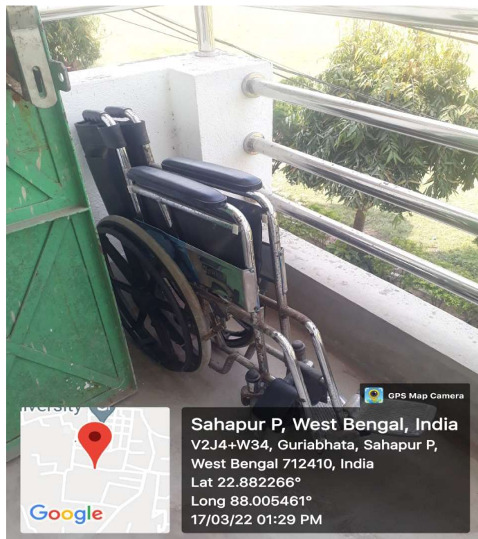
Wheel Chair for Divyangjan