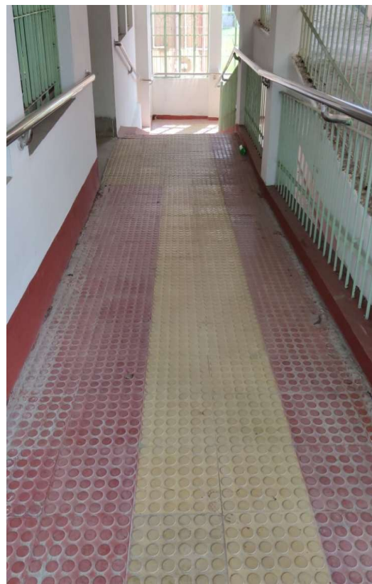
Ramp joining RUSA & Main building