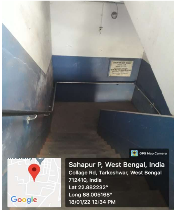
Railing in the staircase of the Main Building